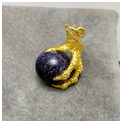
Charm Claw holding Stone in 9ct Gold date vintage, Lilly's Attic since 2001