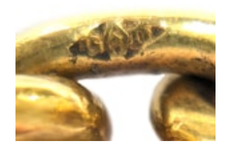
Desbazeille Art Nouveau Champagne Diamond and Gold Cufflinks, Circa 1895 £21,000.00