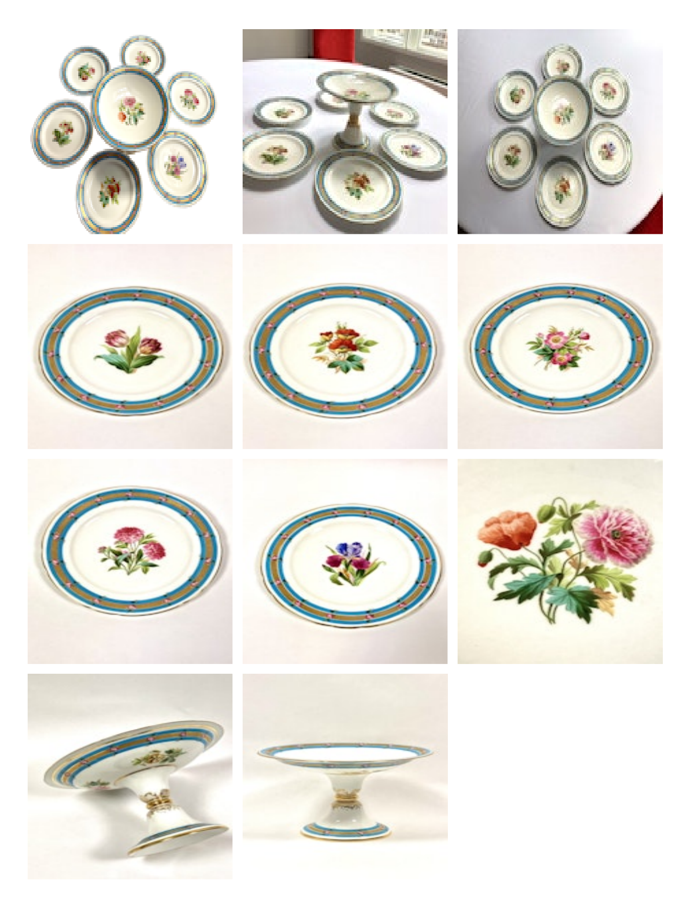
Minton part dessert service POA