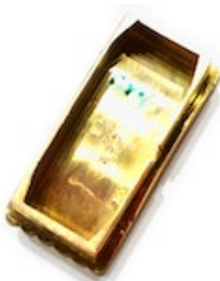
Vintage Universal Gold Watch With Sliding Cover, Circa 1950 £7,500.00