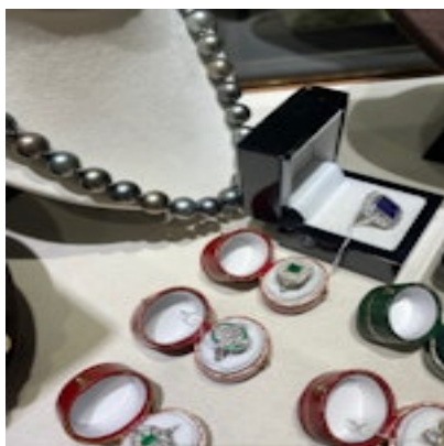
Emerald Diamond Ring in 18ct White Gold date circa 1980, SHAPIRO & Co since 1979