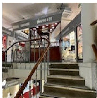
SHAPIRO & Co since 1979