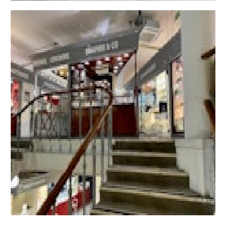
SHAPIRO & Co since 1979