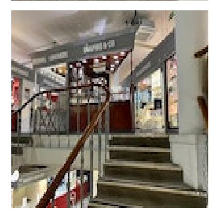
SHAPIRO & Co since 1979