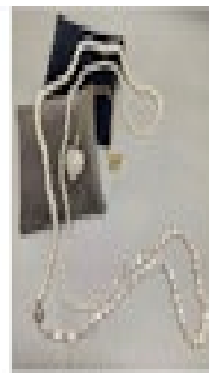
Pearl Necklaces made from 100% recycled material PRICE: £225