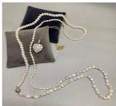
Pearl Necklaces made from 100% recycled material PRICE: £225