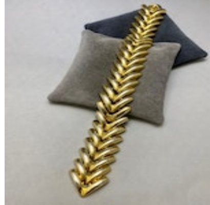
Bracelet in Gold Tone Base Metal date circa 1970, Lilly's Attic since 2001 £125.00