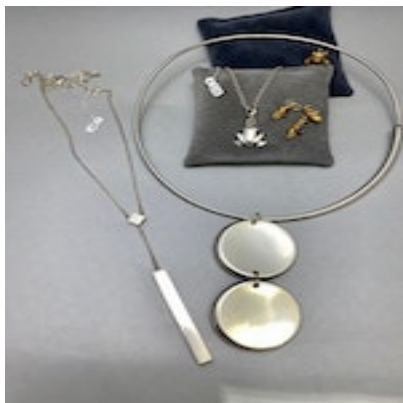
Selection of GEORG JENSEN necklaces date Vintage, SHAPIRO & Co since 1979