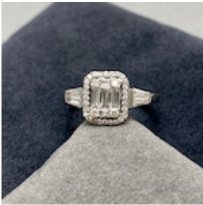
Diamond Ring in 18ct White Gold date circa 1990, SHAPIRO & Co since 1979 £2,750.00

Q: When were emerald cut diamonds popular?