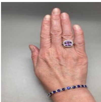
Amethyst Diamond Ring in 18ct White Gold date circa 1990, SHAPIRO & Co since 1979