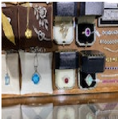
Rubellite Tourmaline Diamond Ring in 18ct White Gold date circa 1980, SHAPIRO & Co since 1979