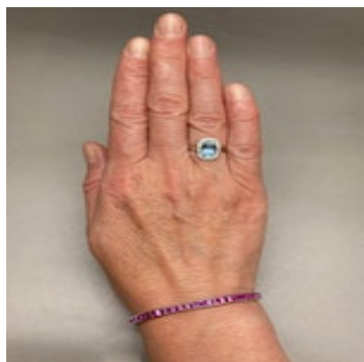
Pink Sapphire Line Bracelet in 18ct White Gold date circa 1980, SHAPIRO & Co since 1979