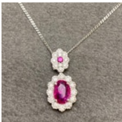
Ruby Diamond Pendant in 18ct White Gold date cica 1980, SHAPIRO & Co since1979