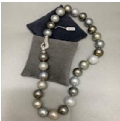
South Sea Pearl Necklace with 18ct White Gold Clasp date circa 1980, SHAPIRO & Co since 1979