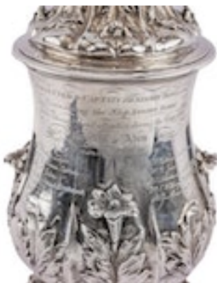
A fine William IV silver tankard by Charles Fox (II), London, 1830 £2,500.00