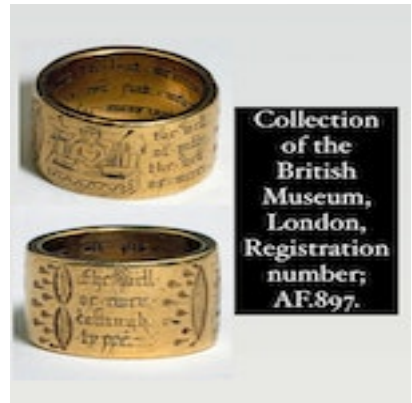
Collection of the British Museum, London, Registration number; AF.897.