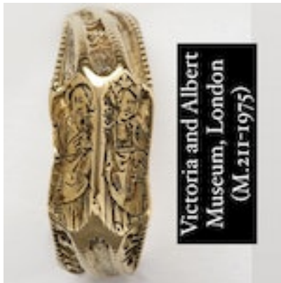
Victoria and Albert Museum, London (M.211-1975)