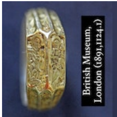
British Museum, London (1891,1124.1)