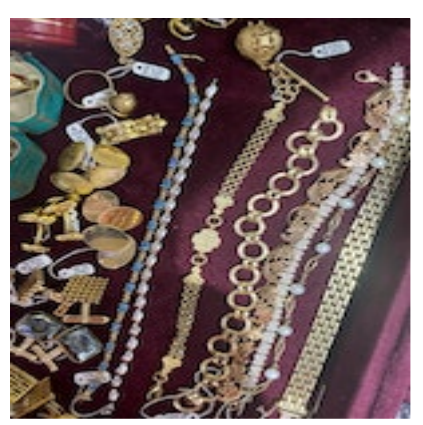
SHAPIRO & Co since 1979