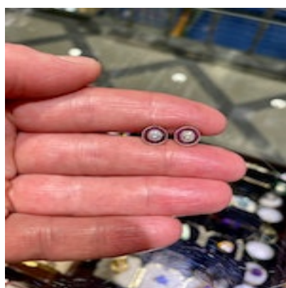
Ruby Diamond Target Halo Earrings date circa 1980, SHAPIRO & Co since 1979