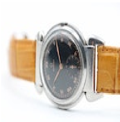
Omega Gilt Dial Bull Horn Lug Vintage Cal. 26 £2,750.00