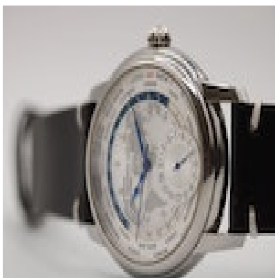
Frederique Constant Worldtimer FC-718WM4H6 £2,650.00