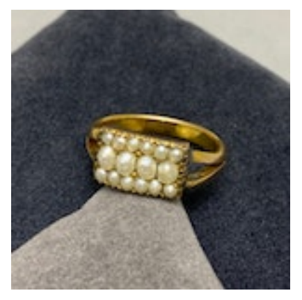
Pearl Ring in 9ct Gold date circa 1890, Lilly's Attic since 2001 £525.00