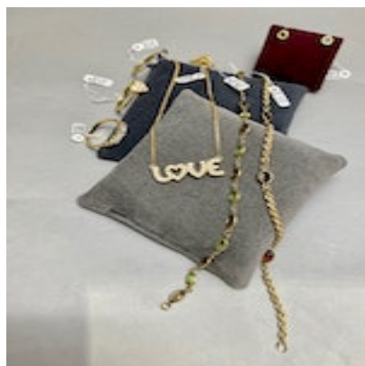
SHAPIRO & Co since 1979