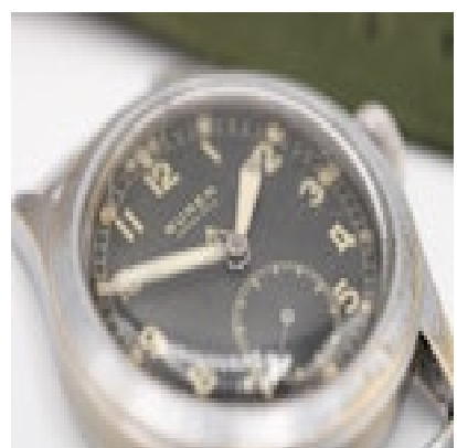
Buren WWI British Military Watch 'Dirty Dozen' £1,850.00