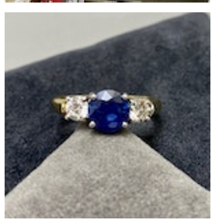
Sapphire Diamond Three Stone Ring in 18ct Yellow/White Gold date circa 1970, SHAPIRO & Co since1979