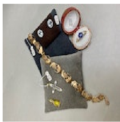
SHAPIRO & Co since 1979