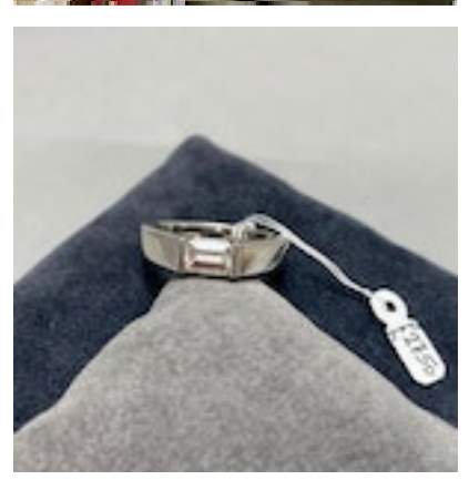
Emerald Cut Single Stone Ring in Platinum dated 2001, SHAPIRO & Co since1979