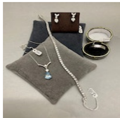
SHAPIRO & Co since 1979