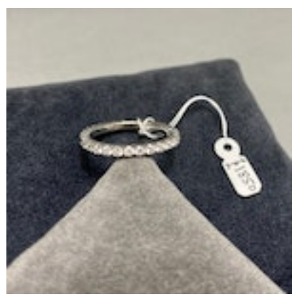
Diamond Eternity Ring in 18ct White Gold date circa 1980, SHAPIRO & Co since1979