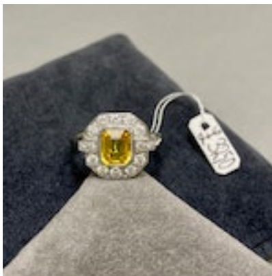
Yellow Sapphire Diamond Ring in Platinum date circa 1960, SHAPIRO & Co since 1979