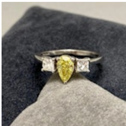
Natural Fancy Yellow Diamond in 18ct White Gold date circa 1970, SHAPIRO & Co since 1979