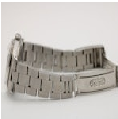
Rolex Oyster Perpetual Date 1988 £3,995.00