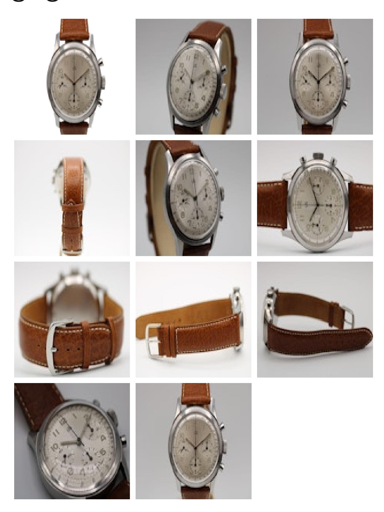
UTI Toptime Chronograph 17765-5 £2,450.00