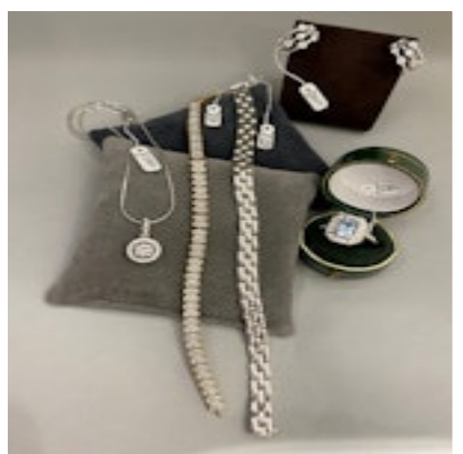
SHAPIRO & Co since 1979