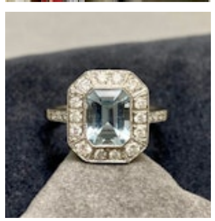
Aquamarine Diamond Ring in Platinum date circa 1980, SHAPIRO & Co since 1979