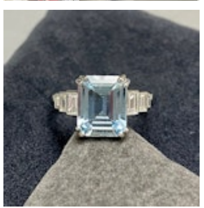
Aquamarine Diamond Ring in Platinum date circa 1960, SHAPIRO & Co since 1979