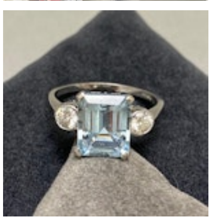
Aquamarine Diamond Ring in Platinum date circa 1960, SHAPIRO & Co since 1979