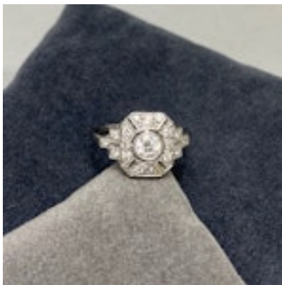
Diamond Ring in Platinum date circa 1950, SHAPIRO & Co since 1979 £2,750.00