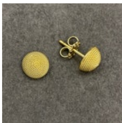
18ct Gold Earrings date London 1963, SHAPIRO & Co since 1979 £1,275.00