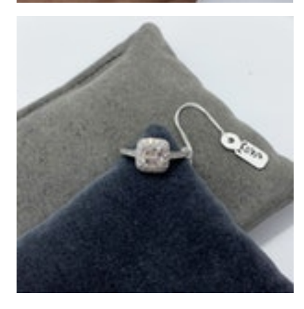
Diamond Ring in Platinum by TIFFANY & CO 0.91ct Diamond F-VS1 SHAPIRO & Co since1979