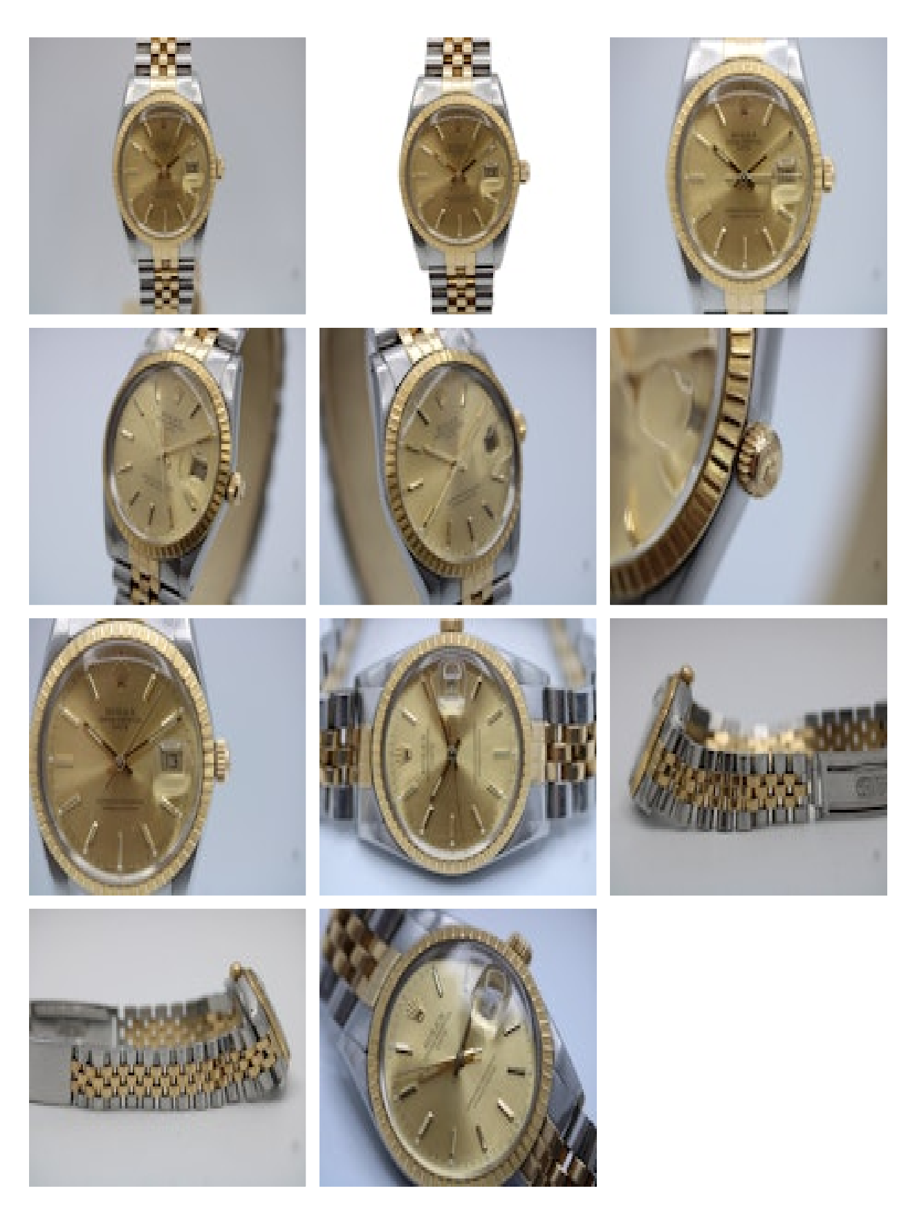
Rolex Oyster Perpetual Date 15053 £3,995.00