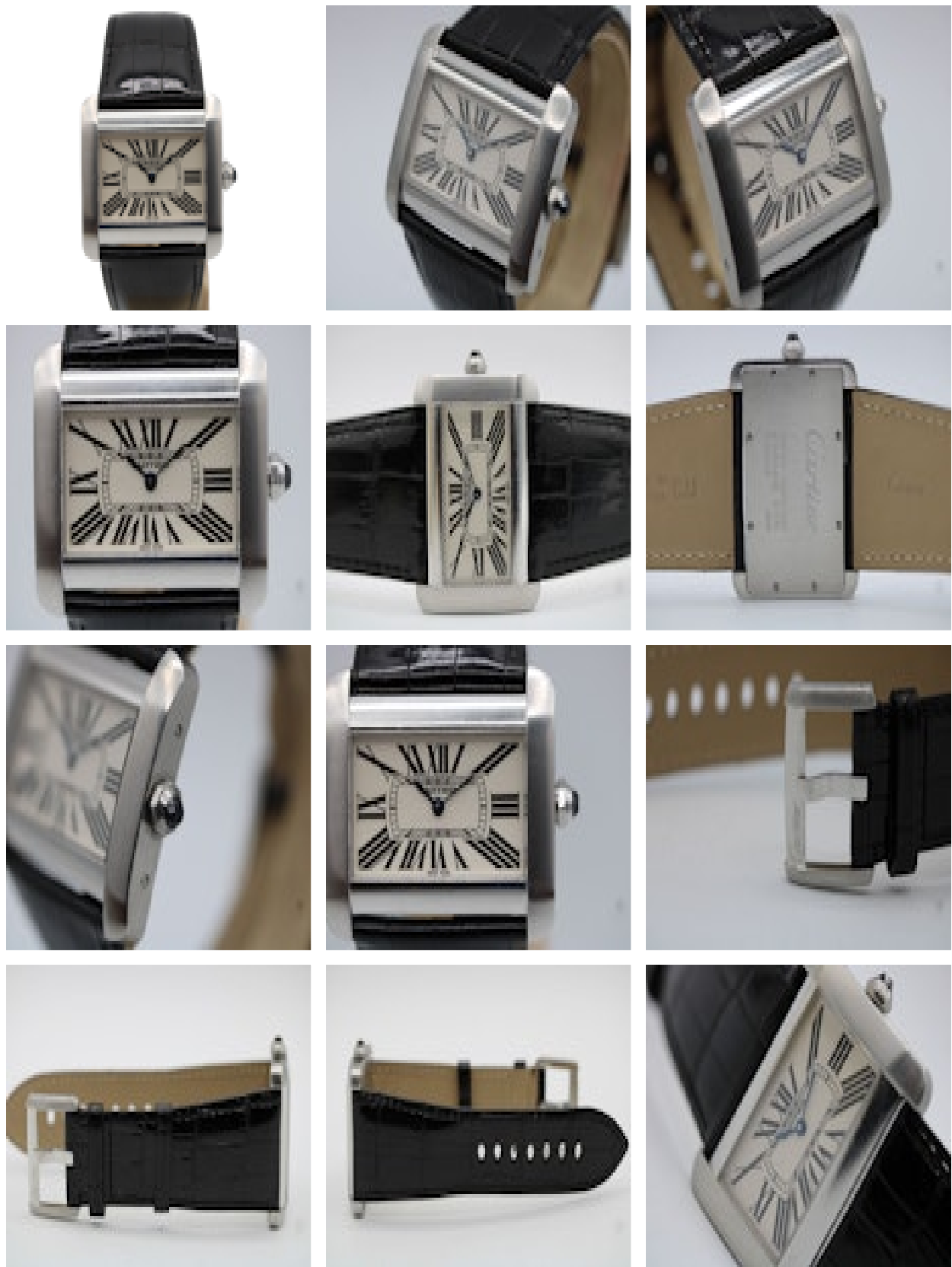
Cartier Tank Divan 2600 £1,995.00