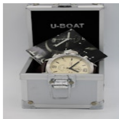
U-Boat B53-08 L1046M Classique Chronograph £1,050.00