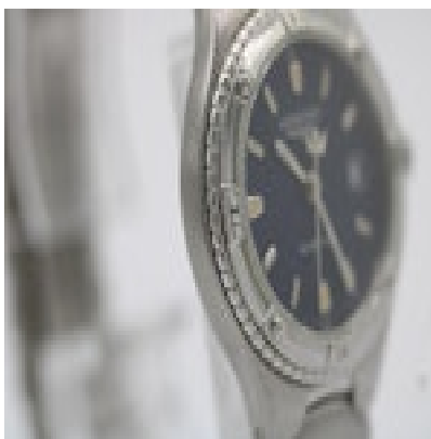
Longines Conquest L3.112.4 28mm £495.00