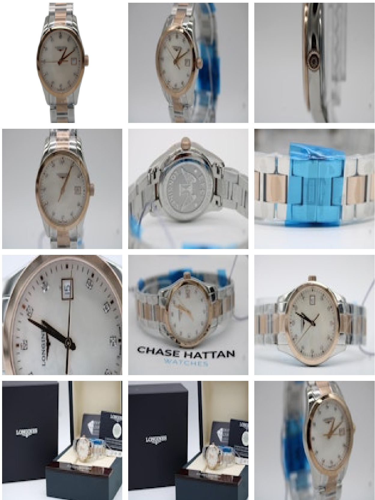
Longines Conquest Classic L2.386.3.87.7 £1,100.00