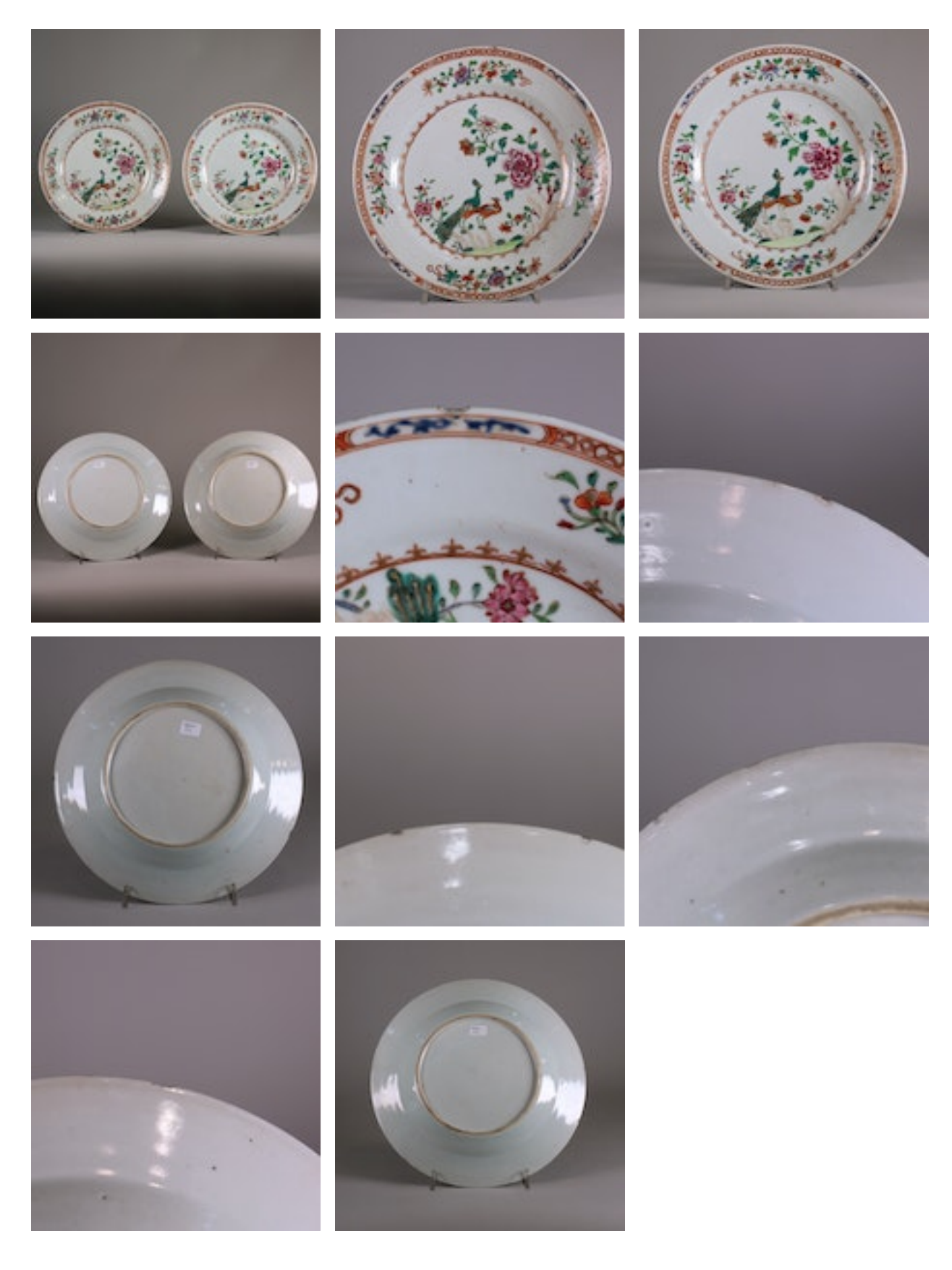
Pair of Chinese 'double-peacock' plates, Qianlong POA