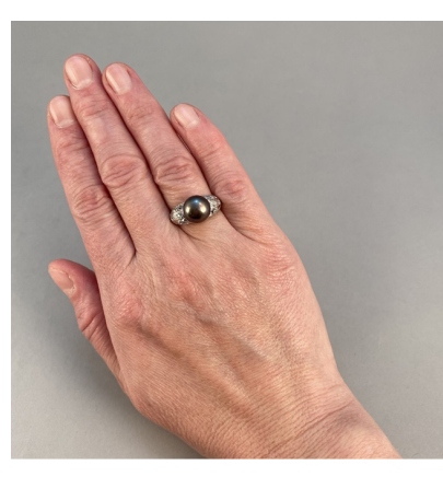
SHAPIRO & Co since 1979