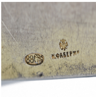
A Fabergé Silver Gilt Jade Box, Moscow, 1899-1908 £12,000.00