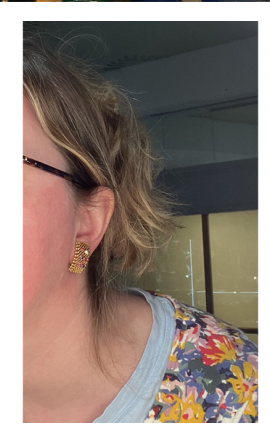
18ct Gold Clip Earrings Ruby Diamond Sapphire by Sannit & Stein for Kutchinsky date circa 1960 SHAPIRO & Co since1979