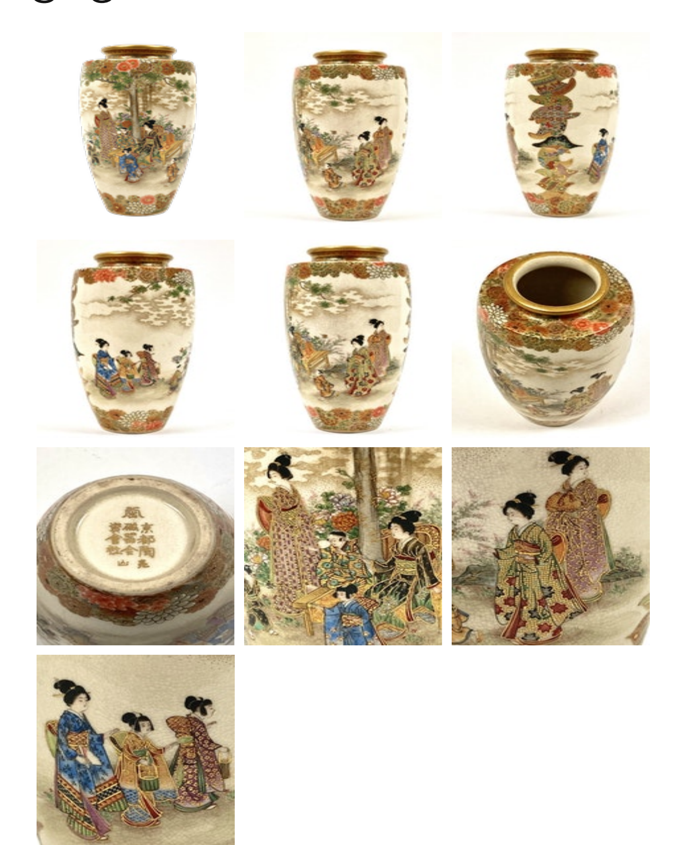
Okatomo Ryozan vase POA