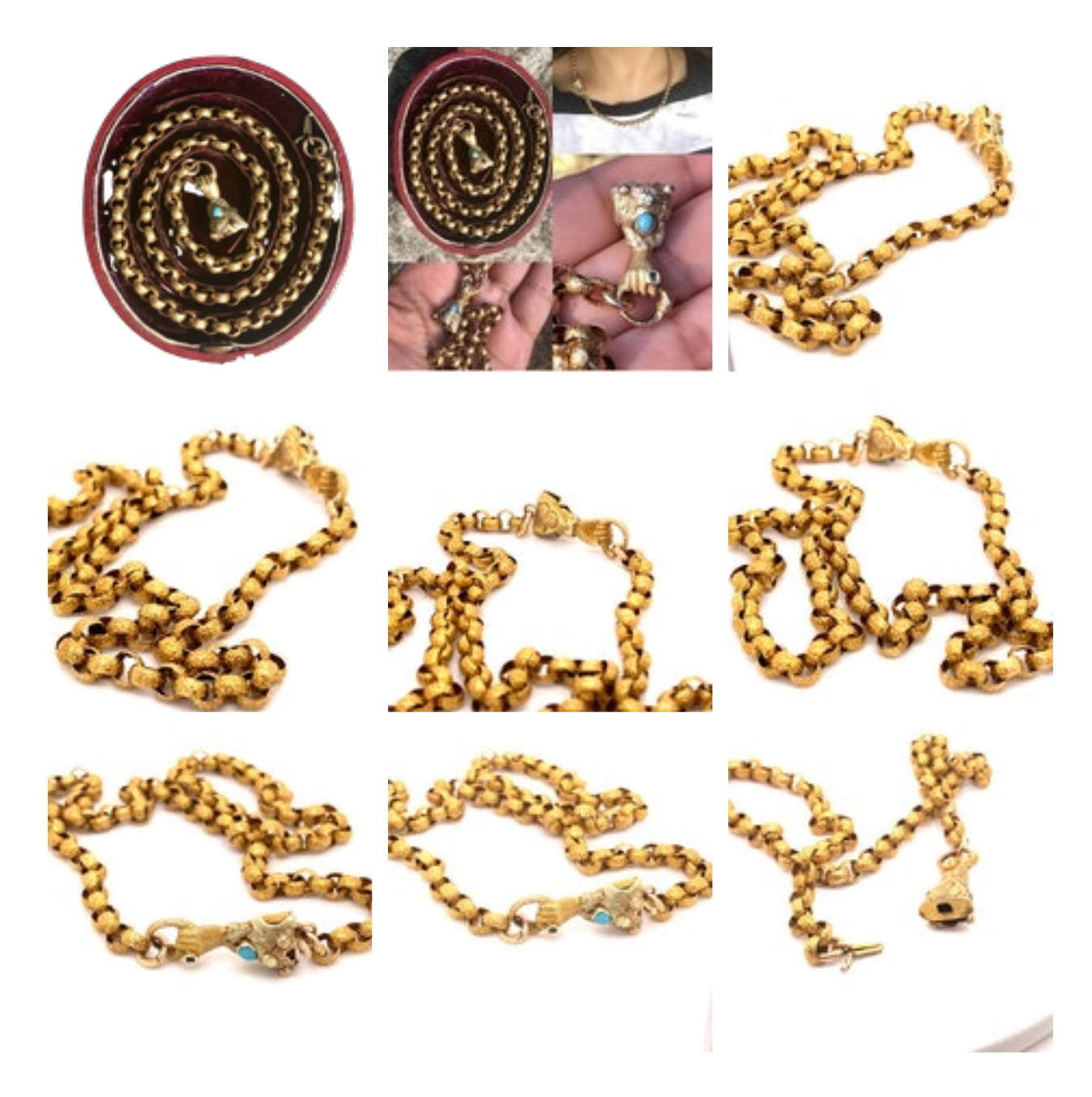
A Gorgeous Georgian Chain with Hand in Tricoloured Gold, with Turquoise and Green stone Ca1790 £4,450.00